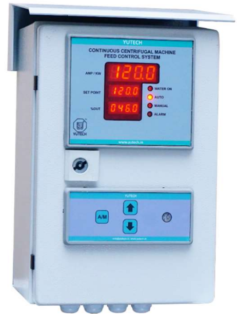
CONTINUOUS CENTRIFUGAL MACHINE AUTOMATIC FEED CONTROL SYSTEM